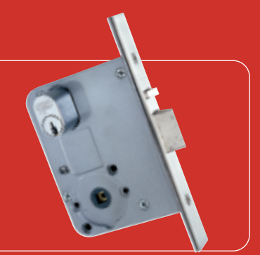
3570 Series Mortice Locks